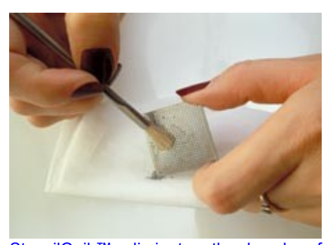
StencilQuik™ eliminates the hassle of cleaning stencils.