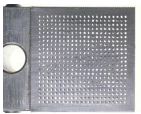
StencilQuik™ eliminates multiple paste print operations due to dirty stencils.