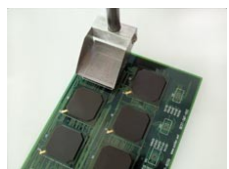
StencilQuik™ allows you to rework a BGA even in tight spaces not accommodated with a metal stencil.