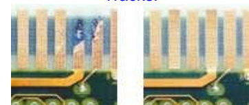
Lands replaced with new dry film adhesive backed lands. Plated holes repaired with eyelets. Conductors repaired with Circuit Tracks.