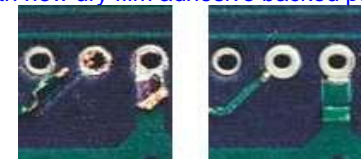
Damaged surface mount pads replaced with new dry film adhesive backed pads.