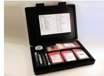
Professional Repair Kit is packaged in an ESD safe carry case.