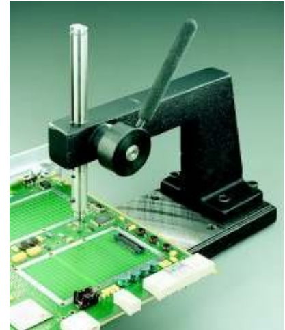
This rugged, heavy duty press precisely forms eyelets in circuit boards for repair or assembly.